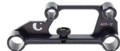
Adaptor 401-12 for 15mm rods with film spacing (401-122) to 15mm video standard.