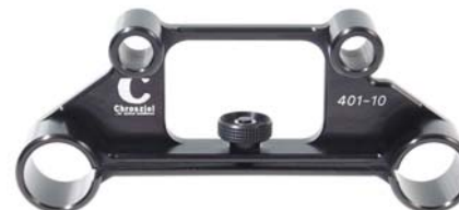
Adaptor 401-10 for 19mm rods with centred mounts to 15mm rods