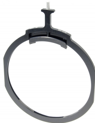
Filterholder 410-38 for round filters on a 150mm stage.