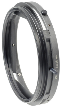
Insert Filterholder 410-05.